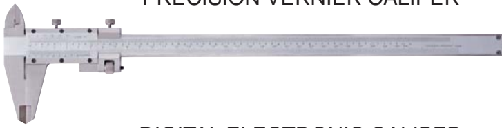
PRECISION VERNIER CALIPER