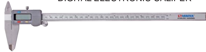
DIGITAL ELECTRONIC CALIPER