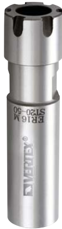
MINI TYPE NUT