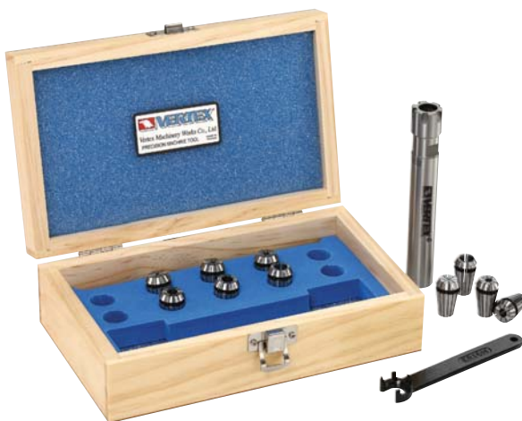
MINI TYPE NUT