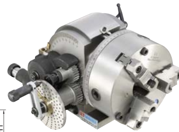
BS-2-J-8 THE CHUCK FIXING HOLE IS FROM FRONT.