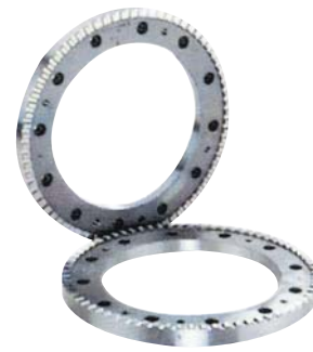
2 PCS HIRTH Coupling